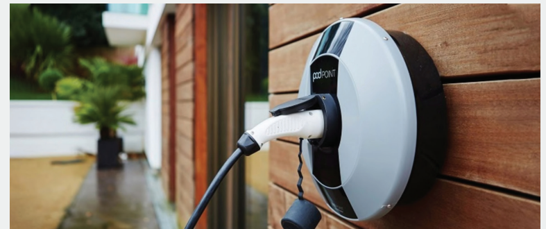
Figure 1: Home Charging Wall Box provided by PodPoint

The UK Government's Road to Zero policy 2 anticipates that traditional ICE cars will be phased out by 2040 with an aspiration that at least 50 per cent - and as much as 70 per cent - of new car registrations will become ultra-low emission EVs by 2030 together with 40 per cent of new vans.