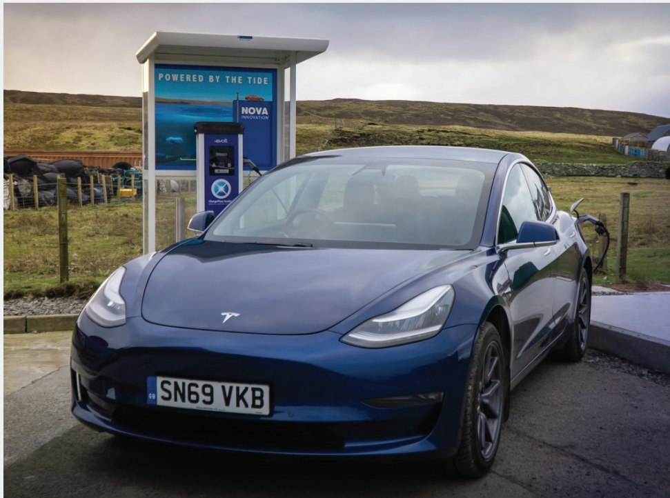
Figure 3: EV charged by Tidal Power derived Charge Point.

compared to conventional vehicles. However, the next generation of EVs such as the popular Nissan Leaf has a driving range of 180 miles while the latest Tesla Model S has a range of over 310 miles. Increased lithium ion battery capacity and advances in battery storage technologies is already leading to major improvements in the total driving range of modern EVs. Given that the average vehicle journey is 9 miles/day the range of an EV should not be a major concern. Access to home charging and the development by the public and private sector of a wide range of fast and ultra-fast EV charging stations will also contribute to building confidence and allaying prospective EV purchasers' anxiety regarding the perceived short driving range of the average EV model.